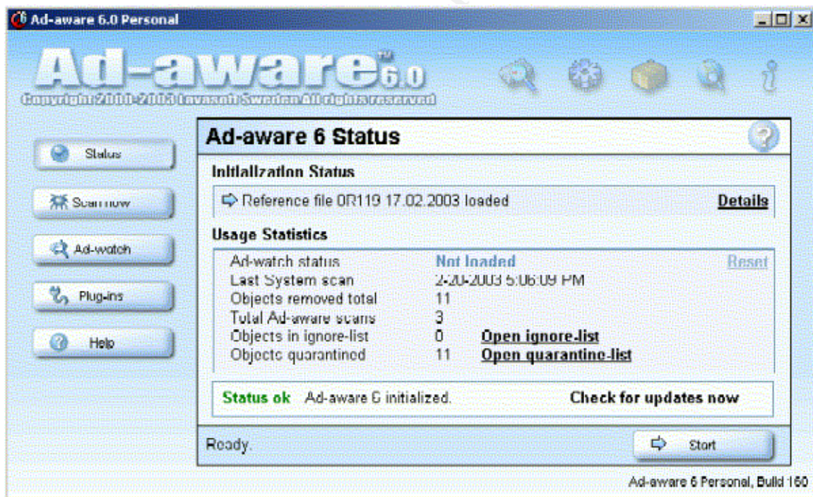
Figure 1 - Ad-aware 6.0

If the spyware has already been downloaded and installed, there are a number of programs available that can successfully detect and remove the spyware from a user's computer. Lavasoft's Ad-aware is one of the more popular spyware removal utilities. Ad-aware thoroughly scans files on the hard drive, contents in the registry and all of the cookies looking for over 4,500 spyware signature files. Once found, these files can be removed or quarantined if the user is unsure about the importance of any of them. Lavasoft provides regular updates for Ad-aware as new spyware signatures are discovered. 6 Figure 1 shows an opening screen-shot of Ad-aware 6.0.