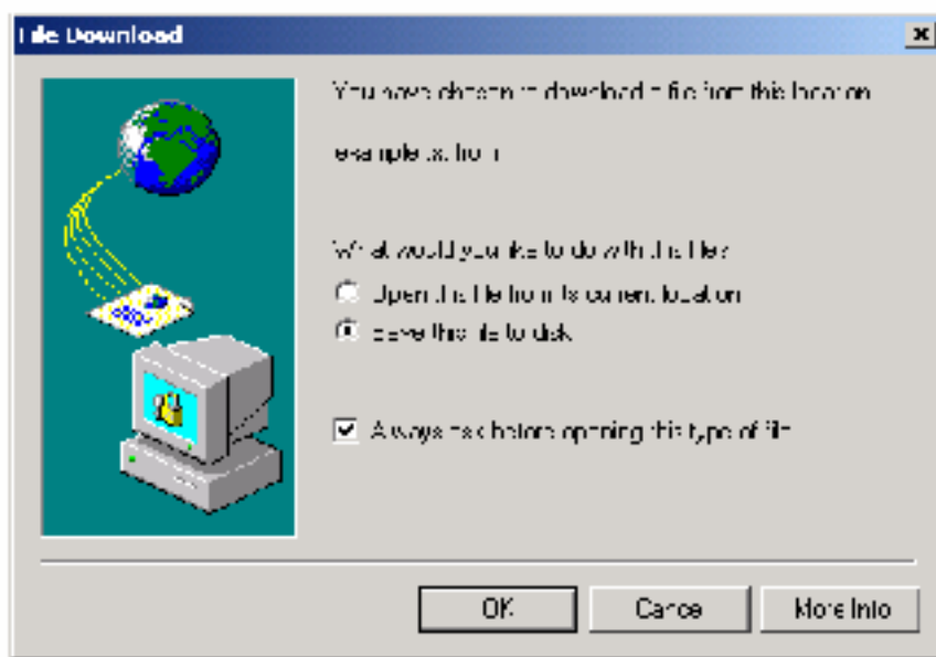
Figure A – Notice the “from” with nothing following it.

Interestingly enough, the patch itself only disables the automatic download of the formerly supposed safe MIME types. It does NOT create a correlation between the file type and the MIME type. This still allows a danger, though not quite so ominous, in the form of the variant listed previously. Forged MIME Types will still allow execution of incorrect file types. However it will prompt the end user first, asking whether the attachment should be saved to disk or executed. When prompted, the input box will show the file name as its “forged” name instead of the actual name of the attachment (see Figure A ).