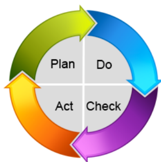
Figure 2 retrieved April 12, 2015 from http://space4ict.com/aq/qc-starter-kit.html .

The vulnerability management program fits nicely into the PDCA model. Each process aligns with a component of the vulnerability management program as shown below: