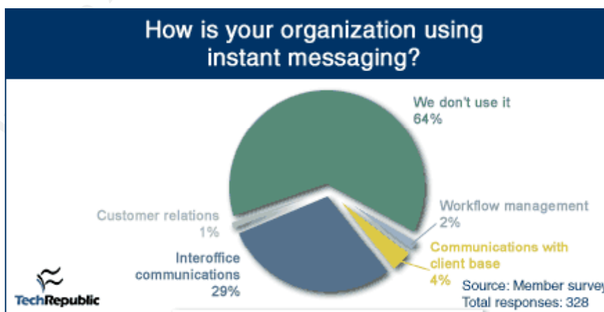
Figure A: “Most organizations aren’t using IM” June 12, 2001 TechRepublic Staff

own Intranet Server for enterprises soon followed. SMS is an IM solution that developed in Europe as the European answer to mainstream IM products. However, in June of 1998,