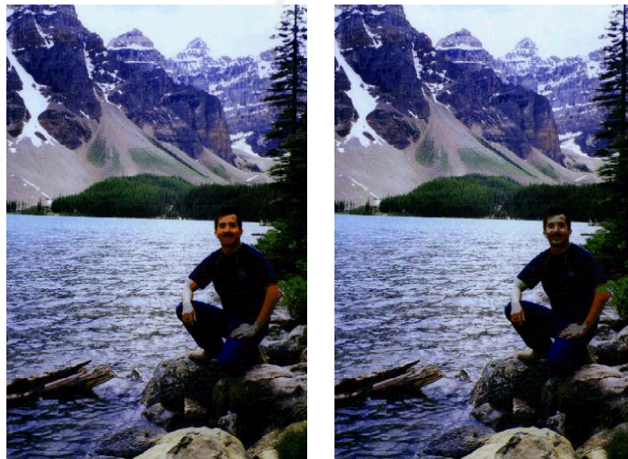
Figure 1: One of these images contains embedded information.

Although most of the initially available tools generated output that could be easily defeated by simple statistical analysis, various tools have appeared recently with more sophisticated information hiding and encryption algorithms that can escape simple forms of statistical analysis. For example, content encoded using the latest version of Outguess[16], a freely available tool on the Internet, is not detectable using most available tools to detect steganographic content. Similar to encryption technologies, new encoding techniques are being developed at the same rate as techniques to detect them.