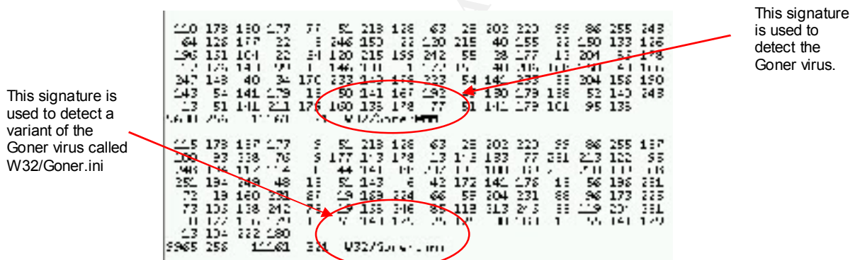
Figure 1 Virus Signature of the Goner Virus

Viruses, worms, and Trojans are written with the intent of wreaking havoc to vulnerable systems and networks. Just like you have delinquents that like to vandalize buildings and train carts with graffiti, the same exhilaration is experienced when a system has been compromised due to a virus payload. Anti-virus software acts as a countermeasure or graffiti repellant paint in order to detect and protect against viruses, worms, and Trojans. They are programs that search files or computer memory for the presence of a known virus. This is accomplished through the use of a database of signatures, usually found in a virus signature file. This signature provides virus information to the engine, which in turn makes a decision to take the appropriate action based on the configuration of the software. Figure 1 presents what is typically found in a signature file, in this case the Goner virus signature. A signature is comprised of unique letters and numbers that are found within the code of a virus. The anti-virus software engine compares found strings in infectious attachments using the characters found in the signature file. If the letters and/or numbers of the virus match the contents of the signature file, a virus has been found. The engine then responds by either prompting the user for an action, deleting the infected file, moving the infected file, cleaning the infected file or denying access to the infected file.