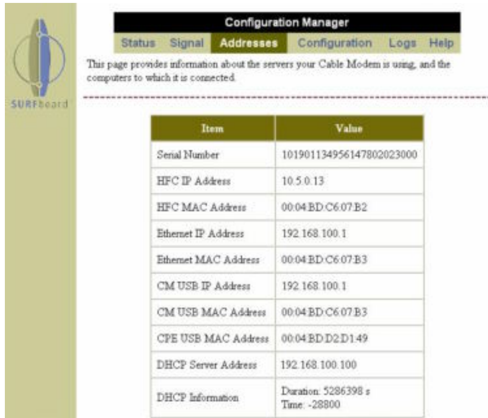
Figure 2 : DHCP Server Address Visibility in Web Interface

Finally, clicking on the Logs tab will allow the user to scroll through the log file and transcript of the initialization and registration process. In figure 3 below, note that the name of the downloaded TFTP configuration file is plainly available.