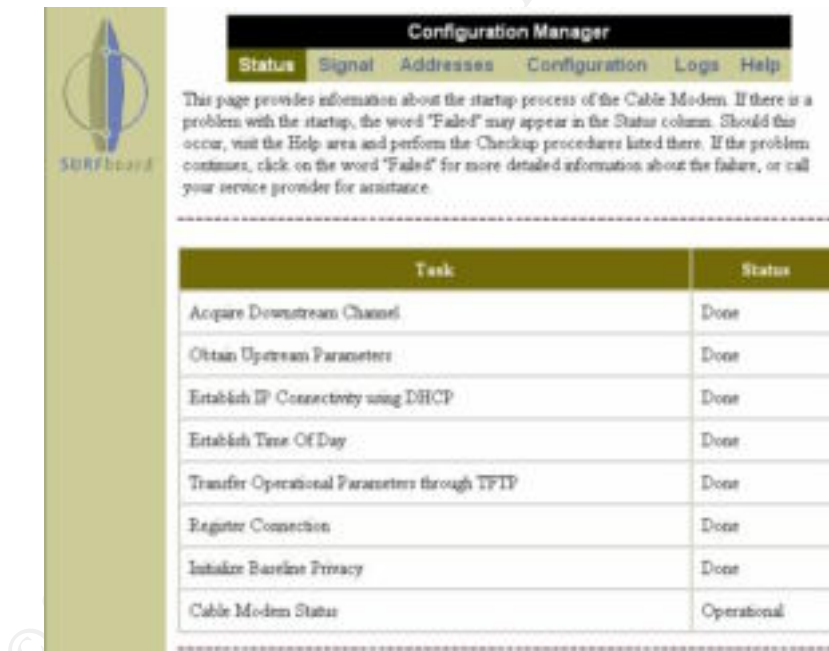
Figure 1 : Motorola Surfboard web interface at http://192.168.100.1