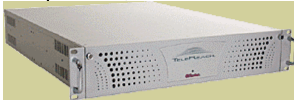
Figure 2 – (Nance, Feature p.1).

Reach is required for access via a web browser. Using this switch allows for three different modes of access: private (exclusive access to a server), public-view (more than one user can see the server screen), and PC-share (multiple users have full access to the server).