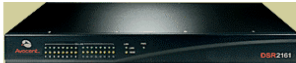
Figure 2 - (Nance, Feature p. 1).

From Avocent there are the Autoview and the DS series. The newer Autoview products support up to 16 servers allowing one local user connected to the analog port, and one or two remote users depending on the model to access the connected servers. The servers connect to the Autoview switch via a unique cable called the AVRIQ. The AVRIQ contains a microprocessor and works with the switch to provide connectivity to the server being controlled. The Autoview switch also comes with the AVWorks management utility that provides auto-discovery and wizard based installation. The switch also comes with On-Screen Configuration And Reporting (OSCAR) for administration at the rack.