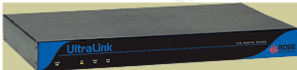
Figure 3 – (Nance, Feature p.2).

The Rose Ultramatrix combined with the Ultralink allows servers to be controlled via proprietary windows based client software. The UltraMatrix X