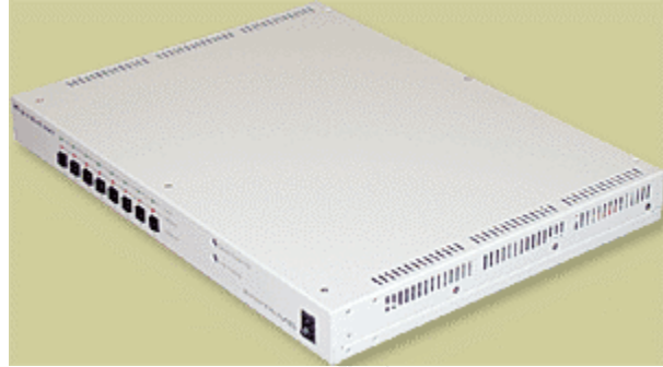
Figure 4 – (Nance, Feature p.2).

The solution from CCC Network Systems is comprised of mini-transmitter devices connected to servers. These transmitters are then connected to a FreeVisionIP Switch. This switch is then connected to a server that compresses the information from the servers and links it to the IP network. The latest release of the FreeVisionIP Remote Network Device Management System is Version 4.0. It supports 4 concurrent IP users.