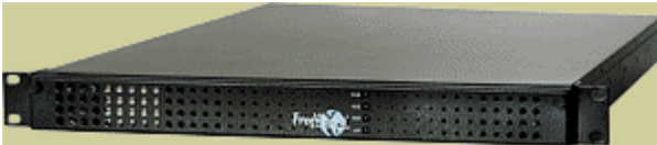
Figure 5 – (Nance, Feature p.2).