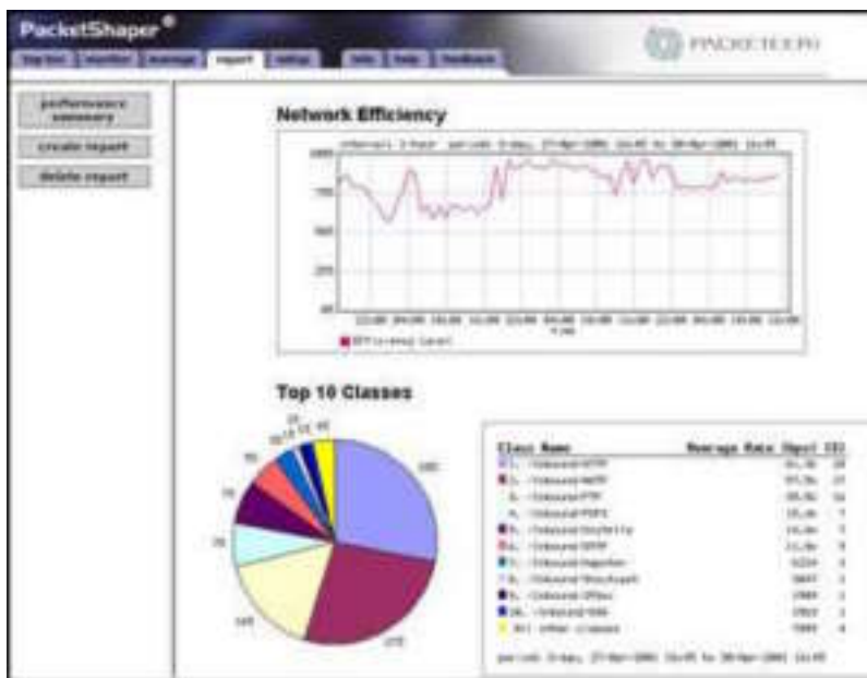
Figure 2. A screen shot of PacketShaper showing network monitoring statistics (Packeteer, Inc., “4-Steps”).

The University of California, Irvine (UCI) is one university that has PacketShaper in use to control P2P traffic on the dorm network. The network staff found that over 50% of the network traffic going outbound to the Internet came from one P2P app. UCI started using PacketShaper in the Fall of 2002 to identify and prioritize network traffic by applications, so that P2P apps are given a significantly lower priority than e-mail and web browsing. In addition, any traffic to any official campus computer is not managed by PacketShaper because UCI assumes that traffic as “educational” traffic. P2P apps are limited to 10 Mbps of bandwidth if it is available out of the 60 Mbps of total bandwidth for the dorm network. UCI made it clear to their dorm residents that PacketShaper is used only for network performance management and would never invade the privacy of the residents--such as finding out what Web sites are visited (The Regents of the University of California).