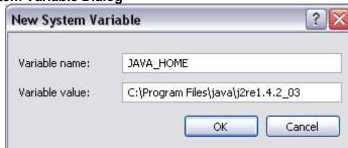
Figure 2: System Variable Dialog