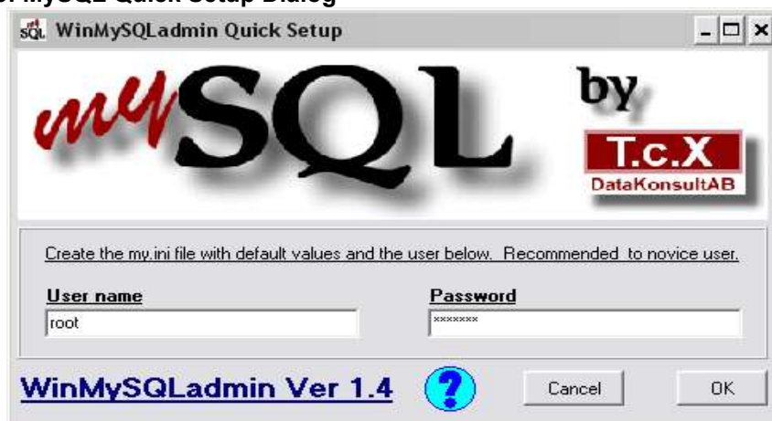
Figure 3: MySQL Quick Setup Dialog

The administration tool will create the c:\%windir%\my.ini configuration file and setup the MySQL service to start automatically when Windows starts.