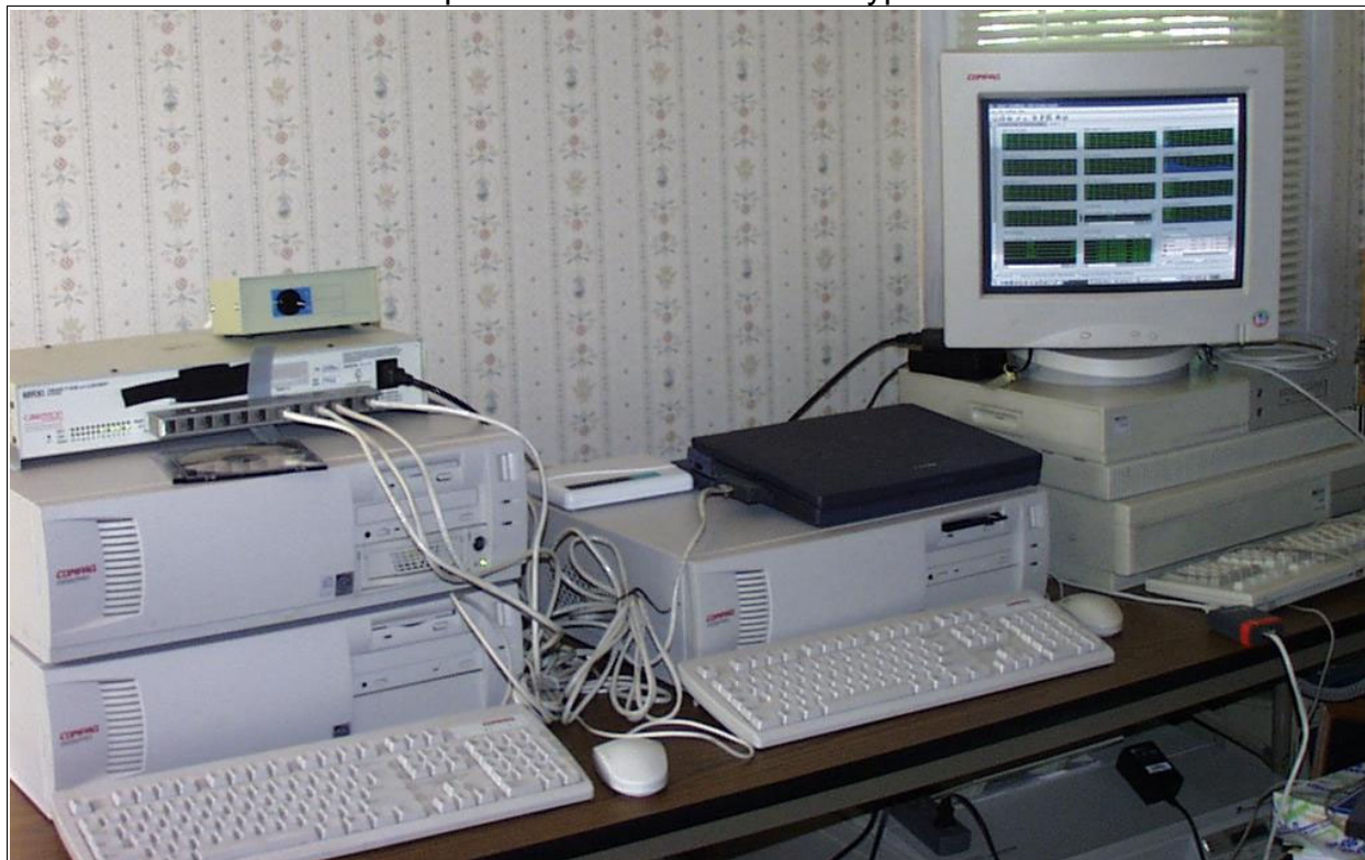
Picture of the Honeypot Network

from the firewall. Below is a picture of the finished honeypot network.