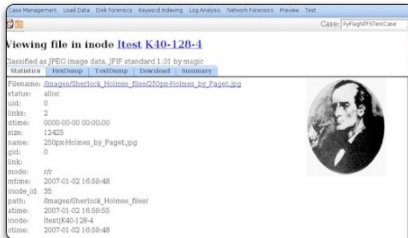
Figure 20. Screenshot of pyFlag forensic tool.