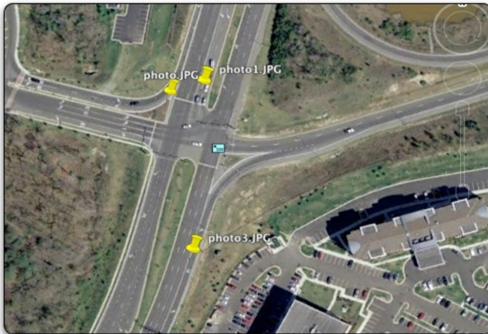
Figure 9. Image locations plotted on Google Maps.

Running our new script, images2KML.py , against a directory of images results in producing a Google map (Figure 9) with plotted points for each image.