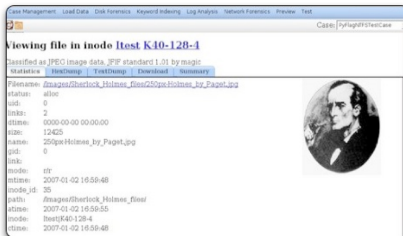
Figure 20. Screenshot of pyFlag forensic tool.