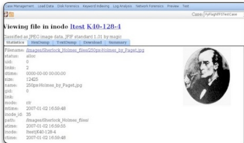
Figure 20. Screenshot of pyFlag forensic tool.