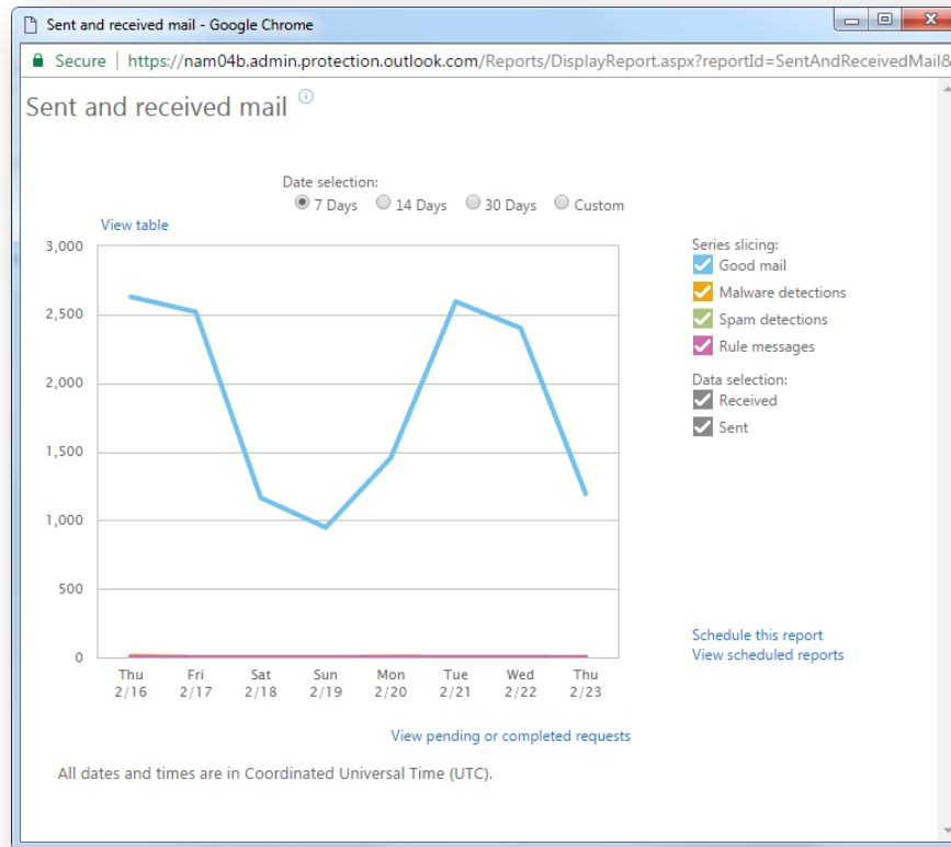
Figure 4- Sent and Received Mail from the Security & Compliance Reports

The “Sent and received mail report” shown above does not show spam and malware detections. With Microsoft’s filtering system they would be shown conveniently in this report.