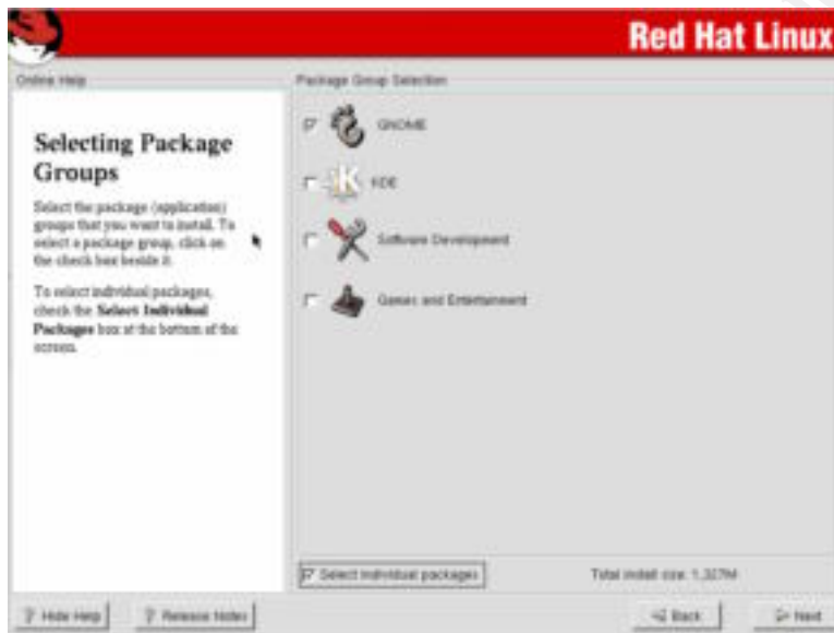
Figure 1 - Package Group Selection Screen with Select Individual Packages Setting

Everything is a special case of the Custom installation class. This obviously installs every piece of software that comes with the distribution. No matter which installation class is chosen, the administrator has the opportunity to fine-tune the installation by choosing the “select individual packages” option as illustrated in Figure 1.