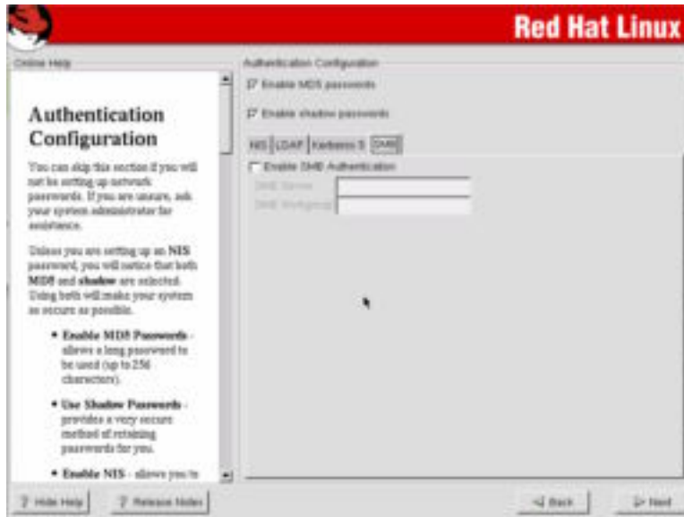
Figure 8 - SMB Tab of the Authentication Configuration Screen