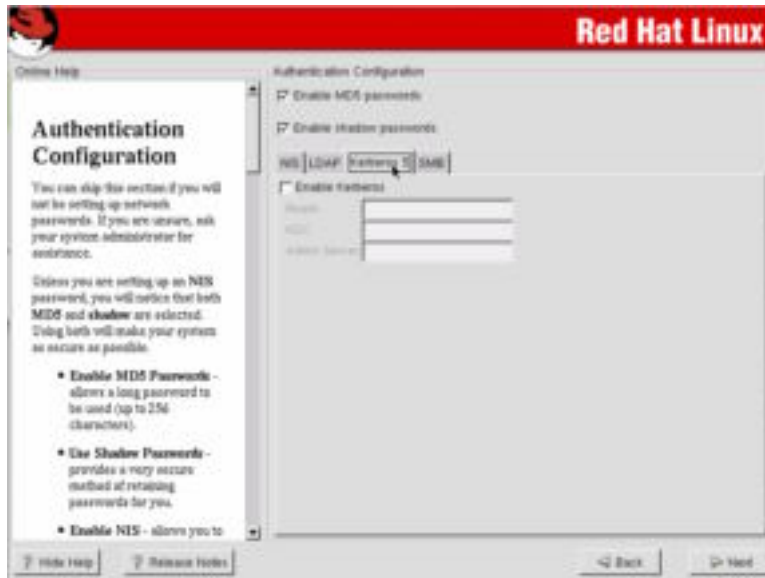
Figure 7 - Kerberos 5 Tab of the Authentication Configuration Screen