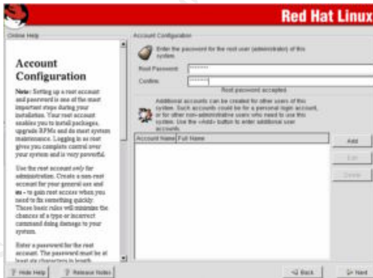
Figure 9 - root Password Entry Screen

The installation program requests that a password for the root user account be entered.