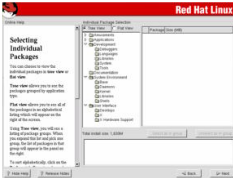
Figure 2 - Viewing Packages to Install with Tree View