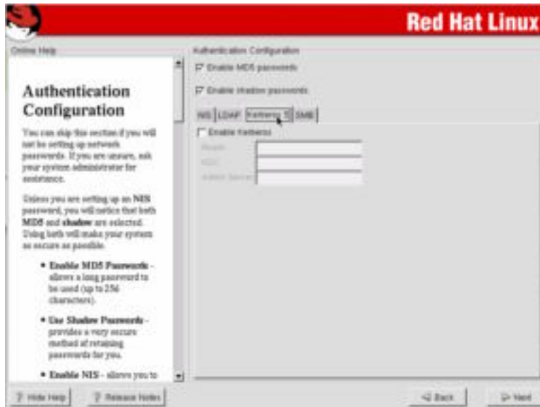
Figure 7 - Kerberos 5 Tab of the Authentication Configuration Screen