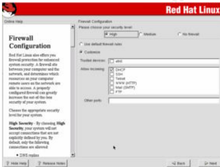
Figure 4 - Firewall Configuration During Installation

For most situations, the firewall configuration at installation will be sufficient. For those situations where it is not, Red Hat Linux 7.3 provides tools for setting up either more elaborate ipchains rules or Netfilter rules. Complicated firewall configuration is a subject that could fill a volume by itself, so it will not be discussed here. Readers who are interested in the tools that Red Hat provides for configuring complicated firewalls should read http://www.redhat.com/docs/manuals/linux/RHL-7.3-Manual/ref-guide/ch-iptables.html .