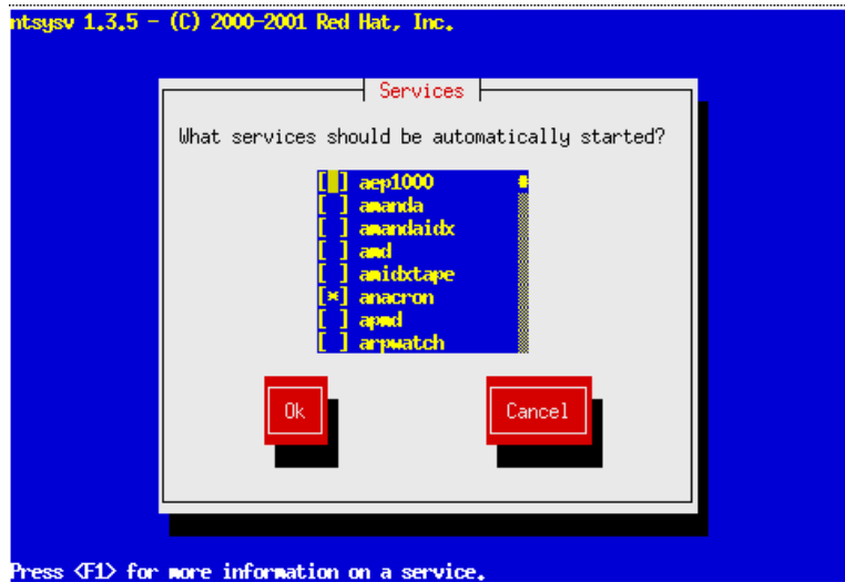
Figure 14 - Example ntsysv Screen

The ntsysv utility actually uses a more basic non-interactive command /sbin/chkconfig . This command and, therefore, ntsysv use specially formatted comments in the service scripts to know in which run levels a service should start and stop and where in the order they should be started and stopped 25 . For example, the /etc/init.d/network script has the comment lines in it: