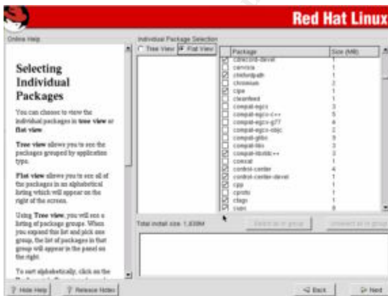
Figure 3 - Viewing Packages to Install with Flat View

Tree view organizes the list into categories to ease the chore of locating packages via their purposes. List view provides an alphabetical list of all packages for those who know exactly what they want by name.