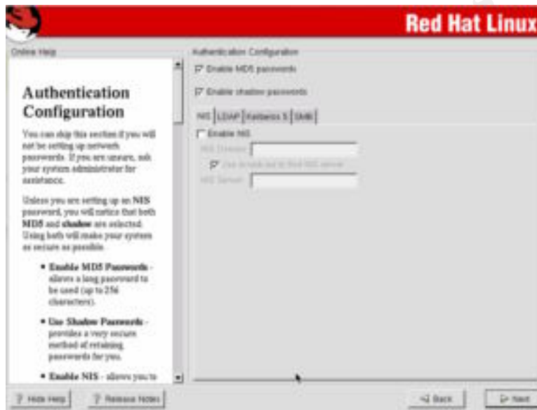
Figure 5 - Authorization Configuration Screen

The Authentication Configuration screen (see Figure 5) only appears if the Custom installation class is chosen. If Workstation, Server, or Laptop installs are performed, only MD5 passwords and shadow passwords are enabled by default, and the others can be turned on as needed after the system is running. A summary of each setting will be provided in this section.