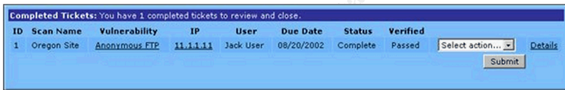
Figure 3 Foundstone Completed Ticket

Like Latis VAM, Foundstone is deployed in a distributed fashion for the same reasons. As well, the scan engine will also tailor the scanning policy to the device being assessed. Foundstone also has the ability to scan in defined windows, pausing or stopping the assessment once the window has expired. For the remediation component, Foundstone utilizes the Foundstone Security Factors™, which includes the ability to assign a risk score to devices based on their level of importance. This aids in presenting the highest risk issues first for mitigation. Once vulnerabilities are identified, they are reported in the Enterprise Manager, assigned to owners and tracked to remediation. An example of a closed ticket is shown below. Note the status and verified fields which show that the issue did indeed pass verification. Foundstone also allows users to verify fixes based on their roles, which can be done either automatically or scheduled. Notifications can be sent to the responsible users whenever new vulnerabilities are found, or when vulnerabilities are removed. In addition, reports can be created based on any logical grouping.