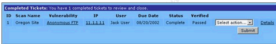
Figure 3 Foundstone Completed Ticket

Like Latis VAM, Foundstone is deployed in a distributed fashion for the same reasons. As well, the scan engine will also tailor the scanning policy to the device being assessed. Foundstone also has the ability to scan in defined windows, pausing or stopping the assessment once the window has expired. For the remediation component, Foundstone utilizes the Foundstone Security Factors™, which includes the ability to assign a risk score to devices based on their level of importance. This aids in presenting the highest risk issues first for mitigation. Once vulnerabilities are identified, they are reported in the Enterprise Manager, assigned to owners and tracked to remediation. An example of a closed ticket is shown below. Note the status and verified fields which show that the issue did indeed pass verification. Foundstone also allows users to verify fixes based on their roles, which can be done either automatically or scheduled. Notifications can be sent to the responsible users whenever new vulnerabilities are found, or when vulnerabilities are removed. In addition, reports can be created based on any logical grouping.