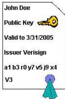
Example of a Certificate

There are generally two types of certificates: client side and server side.