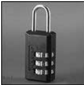
FIGURE 1. Master Lock brand Classic Black Luggage lock

For our example we will think of the combination for the lock as being a password. Each digit in the combination, or place in the password, can take values from 0 to 9, a total of 10 unique values, (0_1, 1_2, 2_3, 3_4, 4_5, 5_6, 6_7, 7_8, 8_9, 9_{10}) . The password for a 3 digit luggage lock would have 1,000 different combinations. So, a four digit lock allows 10,000 different passwords. Expressing this as an equation: