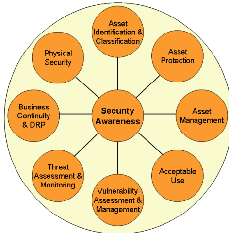
Figure 1: Policy Framework